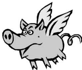
When Pigs Fly . . .